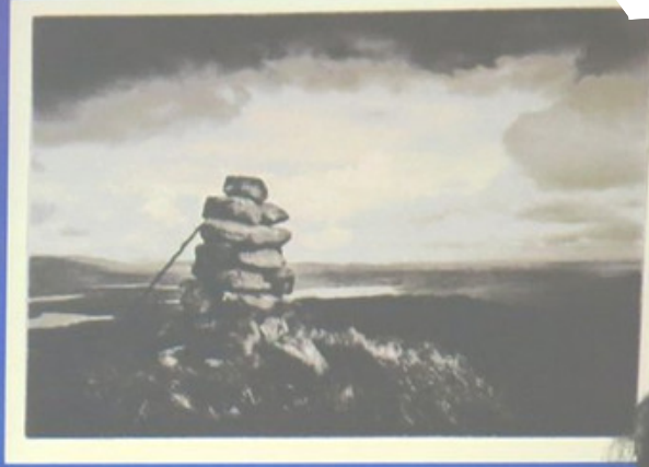
Stacashal (2013), from the series Tir mo Rùin